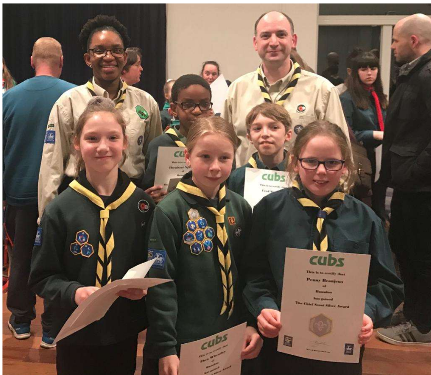
Chief Scout's Silver Award achievers

2020 was certainly a difficult year for us all and like everyone else Hunsdon Scout Group had to adapt to some new challenges.